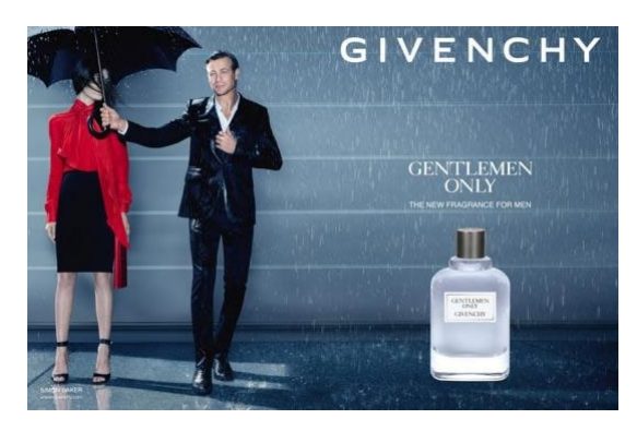
Fig 2. Givenchy Gentleman only perfume, 2015

Fig 2. is a perfume advertisement poster for the product 'Gentleman Only' by Givenchy, released in 2013. The background of this picture is raining. The male model is holding an umbrella for this female actor, while he does not stand under the umbrella. The behaviour of the man holding the umbrella for the woman is considered as a gentleman's behaviour. In this advertisement, he is the symbol of the gentleman image, which corresponds to the 'only gentleman' in the advertisement, as the distinguishing feature of the product from other products.